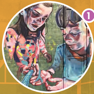
1 FABS (2017, 2018) Evergreen Floors & Doors 2504 E Fourth Plain Blvd West wall