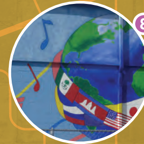
8 Christian Barrios (2017) International Plaza 6000 NE Fourth Plain Blvd East wall