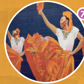
7 Travis London (2018) Grocery Outlet 5800 NE Fourth Plain Blvd South wall