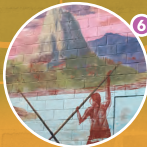
6 Pierre Bombardier (2018) Best Cabinet & Granite Supply 3001 E Fourth Plain Blvd East wall